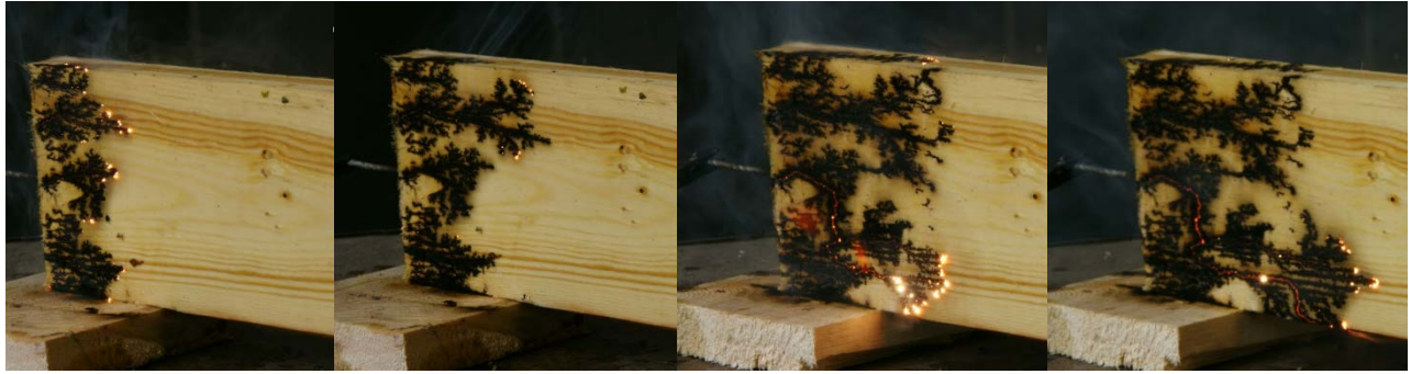
Figure 3: Close up time lapse of Lichtenberg figure growth

current and the figures in this experiment were produced with alternating current, many general principles remain the same. As was shown during the experiment, streamers of electric charge emanated from both contact points within the wood. They grew steadily toward each other, branching out in various directions in accordance with subtle, seemingly random changes in resistance. In general, the fingers appear to follow paths along the grain of the wood as shown in Figure 3 below. This phenomena could be explained by the vascular structure of the wood. That is to say the grain of the wood is a result of the tree's xylem, which is used to transport water via capillary action.<sup>4</sup> These channels probably help to wick the electrolyte solution through the wood, making those paths more conductive to the electricity.