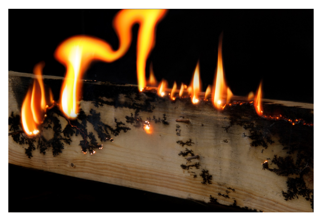
Figure 1: Final, edited image