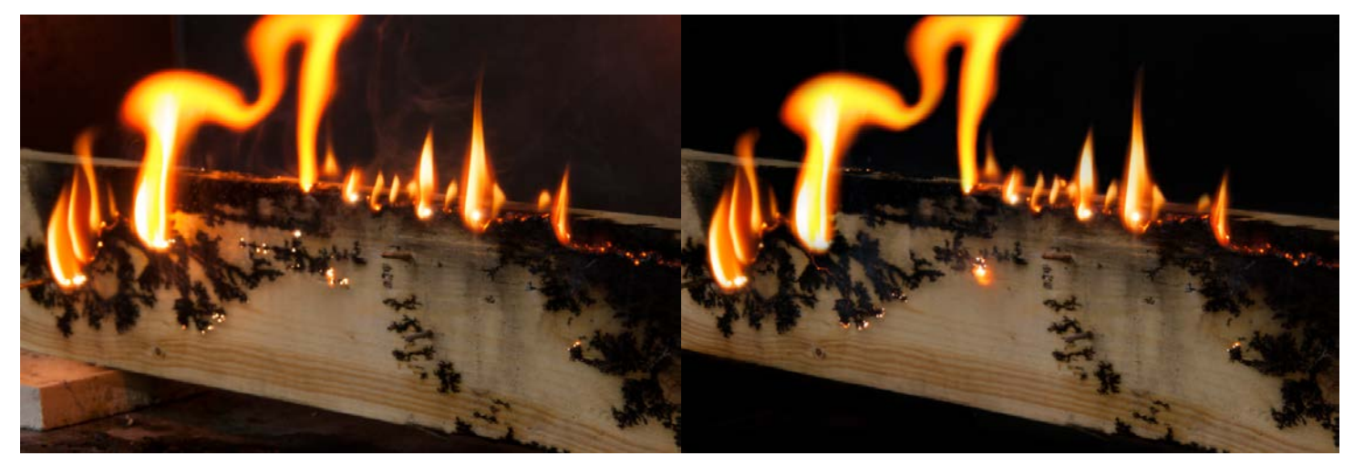
Figure 4: Comparison of before editing (left) and after (right)

motion of the flames, and to increase the exposure since the previous two settings significantly dropped the light level. One of two raw images used to make the final composite is shown below in Figure 4 (left). The two original images are almost identical, excepting a slight difference in time and focus, which made their composition fairly simple, even with only a little Photoshop experience.